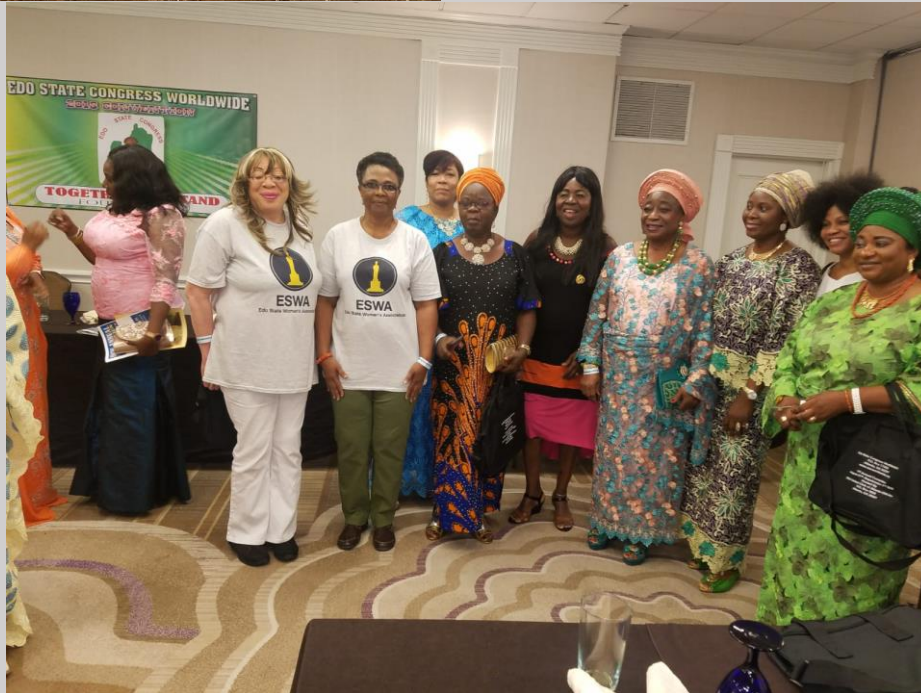
Figure 2 - A selection of images from the Edo State Congress Worldwide 2018 Convention.

Moreover, ESWA has been invited to the Victoria Garden City 2018 Cultural Carnival & Independence Day Celebration in Lagos, Nigeria; another opportunity to raise awareness and secure major donors.