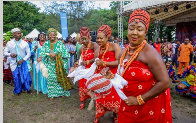
Figure 3 - A selection of images from the Victoria Garden City 2018 Cultural Carnival & Independence Day Celebration in Lagos, Nigeria

As shown by the images in Figure 3, the event was a great success and many visitors were pleased to know they could support ESWA through the security of Global Giving's platform.